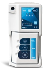
020-001 Smoke evacator ARIA