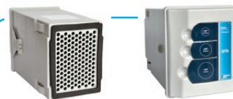
VS353 ARIA- spare filter