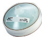
BFPF7/8-10 ARIA, pre-filter, sterile, single-use, 10pcs