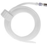
PL0000100 Disposable irrigation tubing - EMED Pump/ OLYMPUS GI Endoscopes (with one way valve)