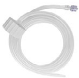
PLPPLF200 Disposable irrigation tubing - EMED Pump/ Pentax-Fujifilm GI Endoscopes (with one way valve)