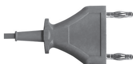
351-031 Bipolar cable, L: 3m, straight connector, 2-pin 29mm plug