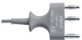
328-030 Electrode handle 1.6mm, small, no switches, cable 3m, 3-pin plug