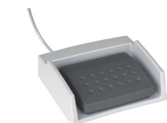
100-301 One-pedal footswitch, for ES120, cable 5m, 6-pin plug