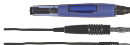
51301018 Handle type F for epilation needles 1.25mm, 4mm plug, separate cable 1.5m