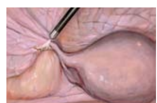
Argon coagulation of endometriosis