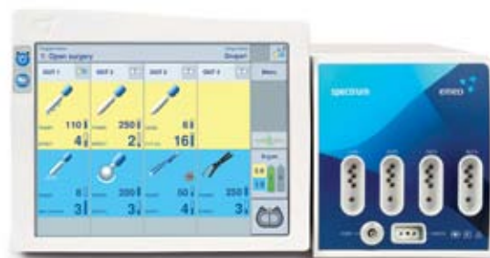
100-013 Electrosurgical Unit spectrum