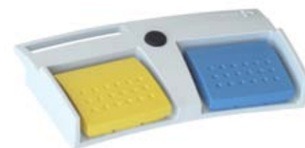
100-313 MultiSwitch, two-pedal footswitch, wireless

See our catalogue for a comprehensive range of accessories. For more information, contact the regional representatives or visit www.emed.pl