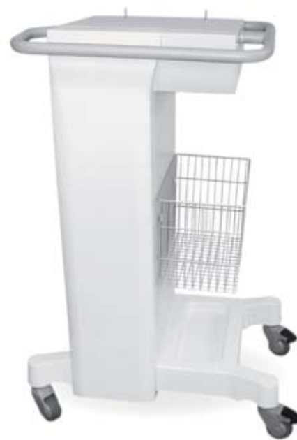
080-100 SpectrumLine trolley for EMED ESU, with case for argon cylinders (2x 5L/10L), basket